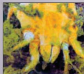
Electron Microgram of dust mite in household dust taken from a vacuum cleaner.

Water has always been nature's way to clean. We routinely wash our clothes, dishes and even ourselves with water. Now we can do the same for our carpets and upholstery. The Thermax AF2 employs a WATER FILTRATION SYSTEM, test proven to be over 99.99% efficient in washing dust, allergens and contaminants from the air, trapping them within the water while you vacuum. The