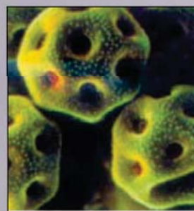
Microgram of Pollen Grains